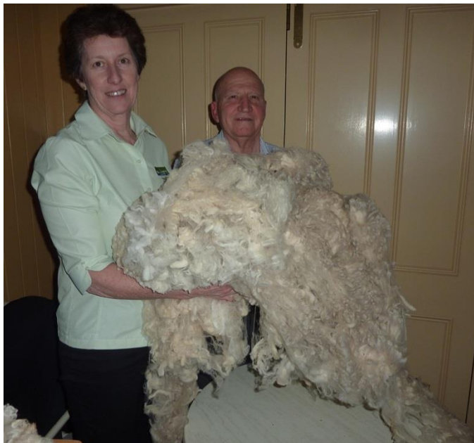
President Lindy with memories of Western Queensland

Richard revealed the mystery of wool and what growers seek to achieve with each fleece.. He said it is the length of the staple, the strength of the staple and the quality count in microns. He explained that fibres which make up the stable and staples make up the fleece. Two samples of fleece were discussed, one from western Queensland and another from New England. They illustrated the latter having a higher micron count, and hence more valuable, as it had more crimps per inch of staple. The finer the fibres the better for spinning and weaving resulting in the production of better quality garments.