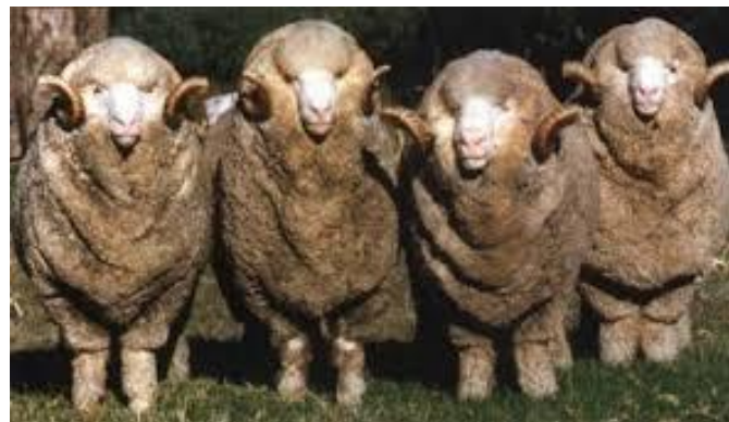
Merinos - the cause of all the commotion

the industry was heading. He spoke of black fibre as undesirable as it devalued the fleece.