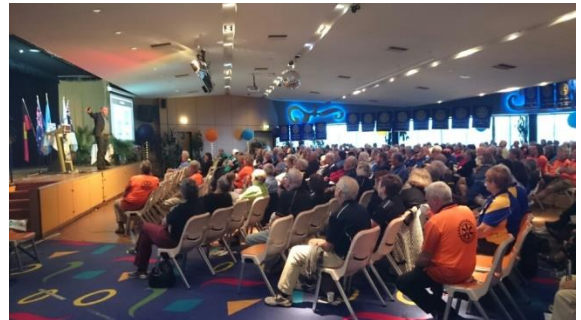
Conference delegates – RCFV at lower RHS