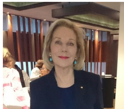
Ita Buttrose at conference