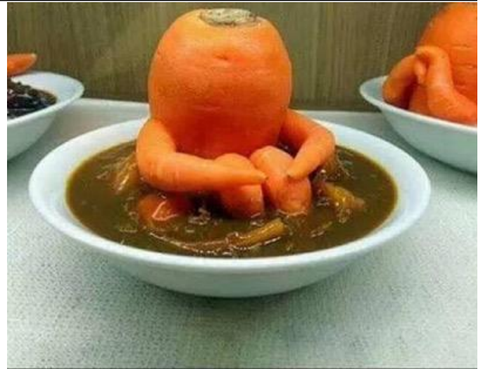
After stewing in his emotions, emo veg comes to the conclusion that the root of the world's problems is that people don't seem to carrot all...